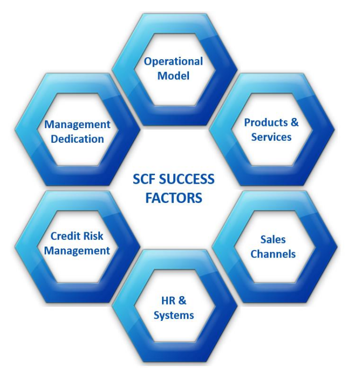
Figure 4. Competency framework of a successful supply chain finance program

Technology solutions are an important factor, although they are not the only driver of success when launching a supply chain finance program. There are other important factors, summarized in Figure 4.